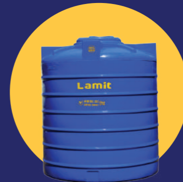
LAMIT EXTRA (Blue & Black)