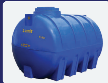
LAMIT EXTRA ( 2 Layer )