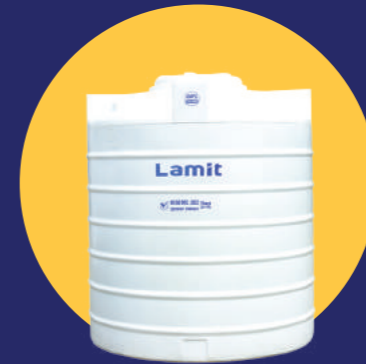
LAMIT PLATINUM (3 Layer)