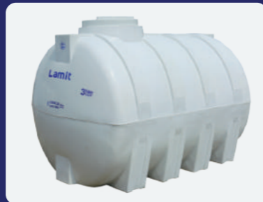
LAMIT PLATINUM WHITE ( 3 Layer )