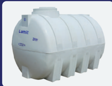
LAMIT PLATINUM 1500L

The top lid of the tank helps to protect the water from debris and unhealthy components from the atmosphere. The shape of the tanks is easy to clean on regular basis.