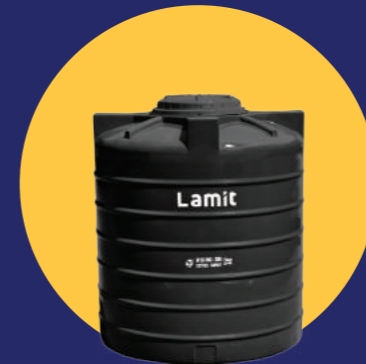
LAMIT GOLD (Blue & Black)